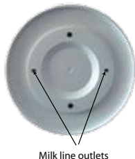
Ewe 2 Plus Lid