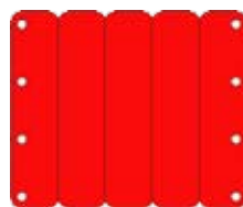
Ewe 2 Plus Insulation Jacket (for very cold weather)